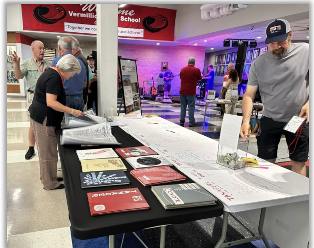
Reunion attendees sign the “decade” posters and review class memorabilia during the Saturday dinner.

Alumni ranging from the Class of 1948 to 2022 attended the Vermillion All School Reunion in June. It was a time to reconnect with old friends, reminisce about the good times, and create new memories. There was a social on Friday evening at the XIX Brewery with the release of a Tanager beer for the occasion. On Saturday, high school tours were given and from 6-9 pm a dinner and social with live music at the high school commons was held. Sunday morning the reunion concluded with a brunch at Cee Cees in downtown Vermillion. A little over $3,200 was raised and will be put towards a new VPSF fundraiser, outdoor learning spaces.