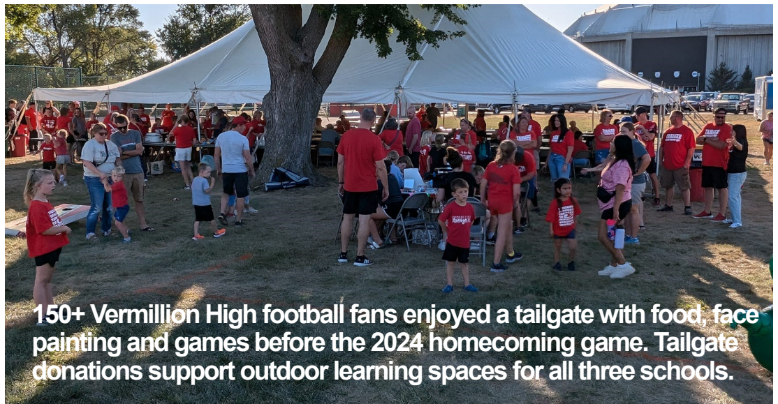
150+ Vermillion High football fans enjoyed a tailgate with food, face painting and games before the 2024 homecoming game. Tailgate donations support outdoor learning spaces for all three schools.

will ensure teachers will be able to attend professional development conferences and activities that enhance their knowledge and enrich the classroom.